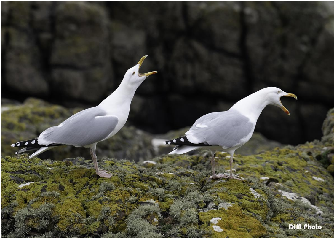
Herring Gulls

Red Breasted Merganser - Machrihanish Bay and by the Observatory – 22 nd – 1, 23 rd – 1.