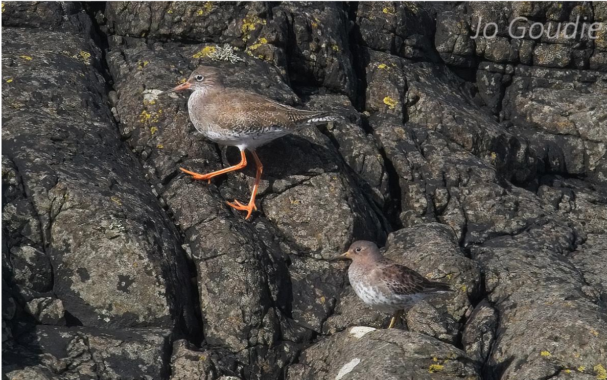
Purple Sandpiper with redshank

Purple Sandpiper – Observatory - 23 rd – 5, 24 th – 2.